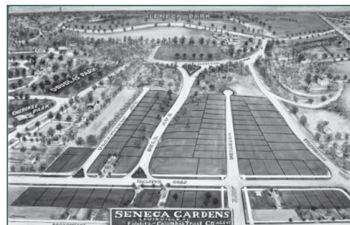
Plans for the Seneca Gardens development, 1922

dens and region surrounding us. Our hope is that a greater understanding of the context of our city will inspire greater pride and volunteerism, for the purpose of making Seneca Gardens and even better place to live.