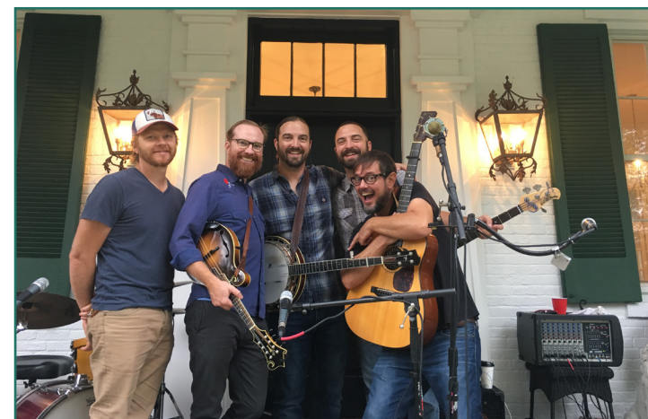
Members of the Bluegrass Relic Band

We served a delicious meal from Morris's Deli that was topped-off by a bounty of homemade goodies. We enjoyed our signature horse carriage rides, along with fantastic music from the Bluegrass Relic Band.