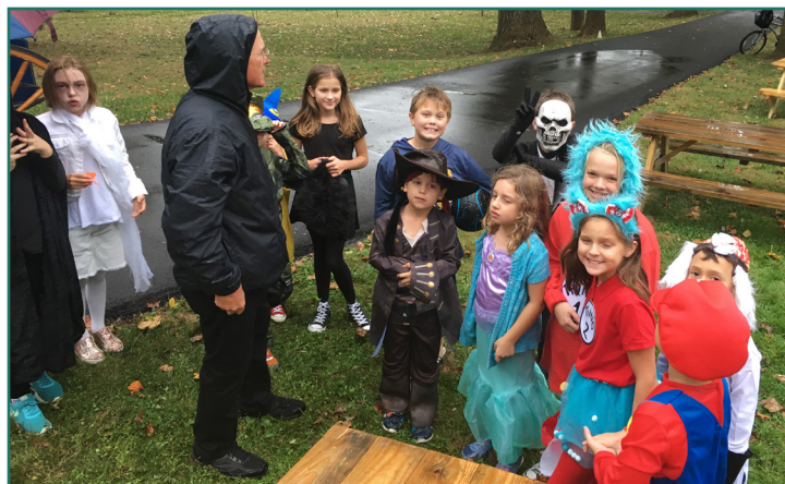
SG thous children lining up for the costume contest

We added a new event that's sure to be a hit for many Gatherings to come: our corn hole tournament drew out the competition for some, and we awarded our winners with a small token of appreciation for competing. Of course, the kids enjoyed our new jump house addition and our halloween contest.