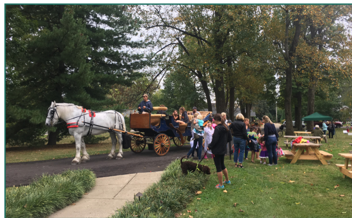
Our signature horse carriage rides were as popular as ever

Our Fall Gathering was a huge success despite the less-than-ideal weather. It was good to see so many SG neighbors talking and laughing and getting to know one-another. We hope you all enjoyed this event., and if you weren't able to make it this year, we hope you'll add this fun event to your 2018 calendar.