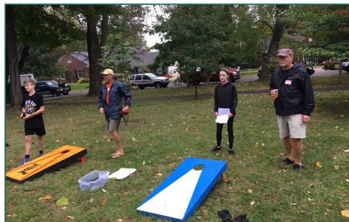
SG residents enjoying a friendly game of corn hole

We added a new event that's sure to be a hit for many Gatherings to come: our corn hole tournament drew out the competition for some, and we awarded our winners with a small token of appreciation for competing. Of course, the kids enjoyed our new jump house addition and our halloween contest.