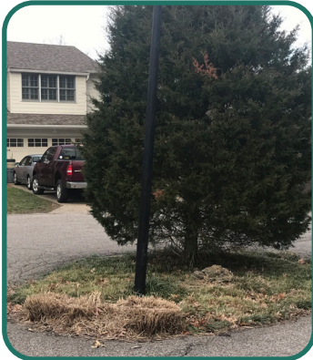
Seneca Valley Road