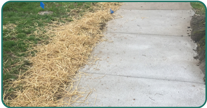
One of the many neighborhood improvements that have recently been made to SG's sidewalks

Two water main breaks on Valletta Road and a sunken drain hazard at the corner of Valletta Road and Trevilian Way were repaired. If you notice problems, please call the appropriate agency or someone on the Seneca Gardens Board.