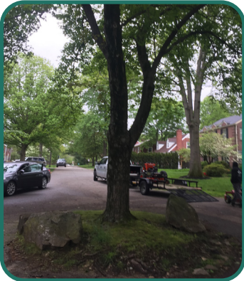
Wood Creek Road

The SG Board has met with the neighbors living around these circles and asked for their input on how they would like us to proceed with this beautification project. The neighbors on both streets wanted to keep the circles and remodel them to the best of our ability. We will keep the neighbors informed on the start date once the plans are approved.