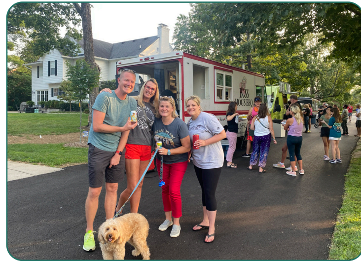
Enjoying a perfect summer Friday, with friends and a food truck

On Friday, June 30th and Friday, August 18th approximately 125 people came out to sample items from several food trucks. Residents, family and friends enjoyed the camaraderie, food, and music.